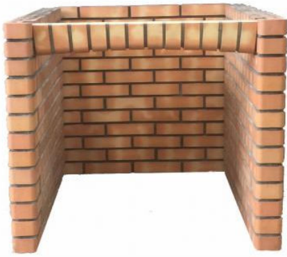
Ref. MF100 Base para horno 100cm