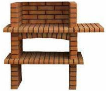
Ref. 100 (P) 58 cm x (H) 115 cm (L) 115 cm • G: 60x40 cm