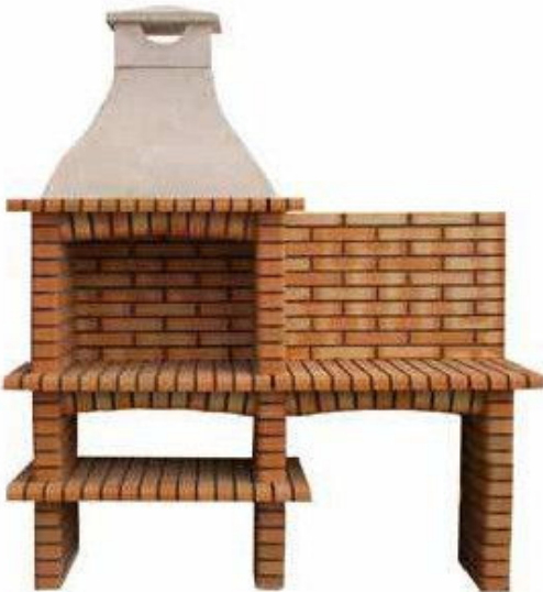
Ref. 127 PT (P) 58 cm x (H) 200 cm x (L) 170 cm • G: 60x40 cm