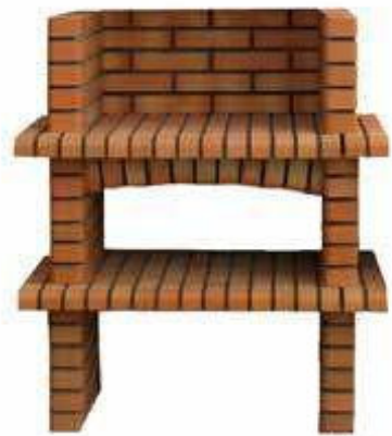
Ref. 121 (P) 58 cm x (H) 115 cm x (L) 91 cm • G: 60x40