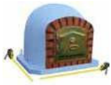
External Measures Mesures Externes Medidas Externas

Pode ocorrer discrepâncias nas medidas e pesos dos fornos, devido a ser trabalho manual (artesanal)