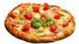
Pizza Ø 30 cm