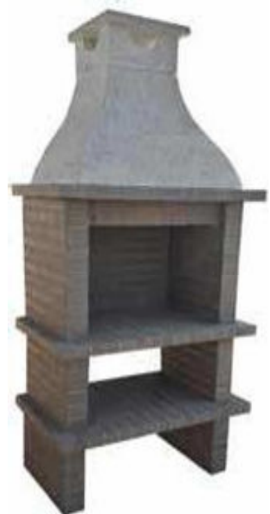
Ref. 224 GRIS

(P) 58 cm x (H) 200 cm x (L) 91 cm G: 60x40 cm