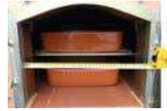
Door Measure Mesure de Porte Medida da Porta